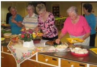
The food did not disappoint!

This was our last regular meeting until September. We will be hosting the Presbytery CT meeting on August 6.